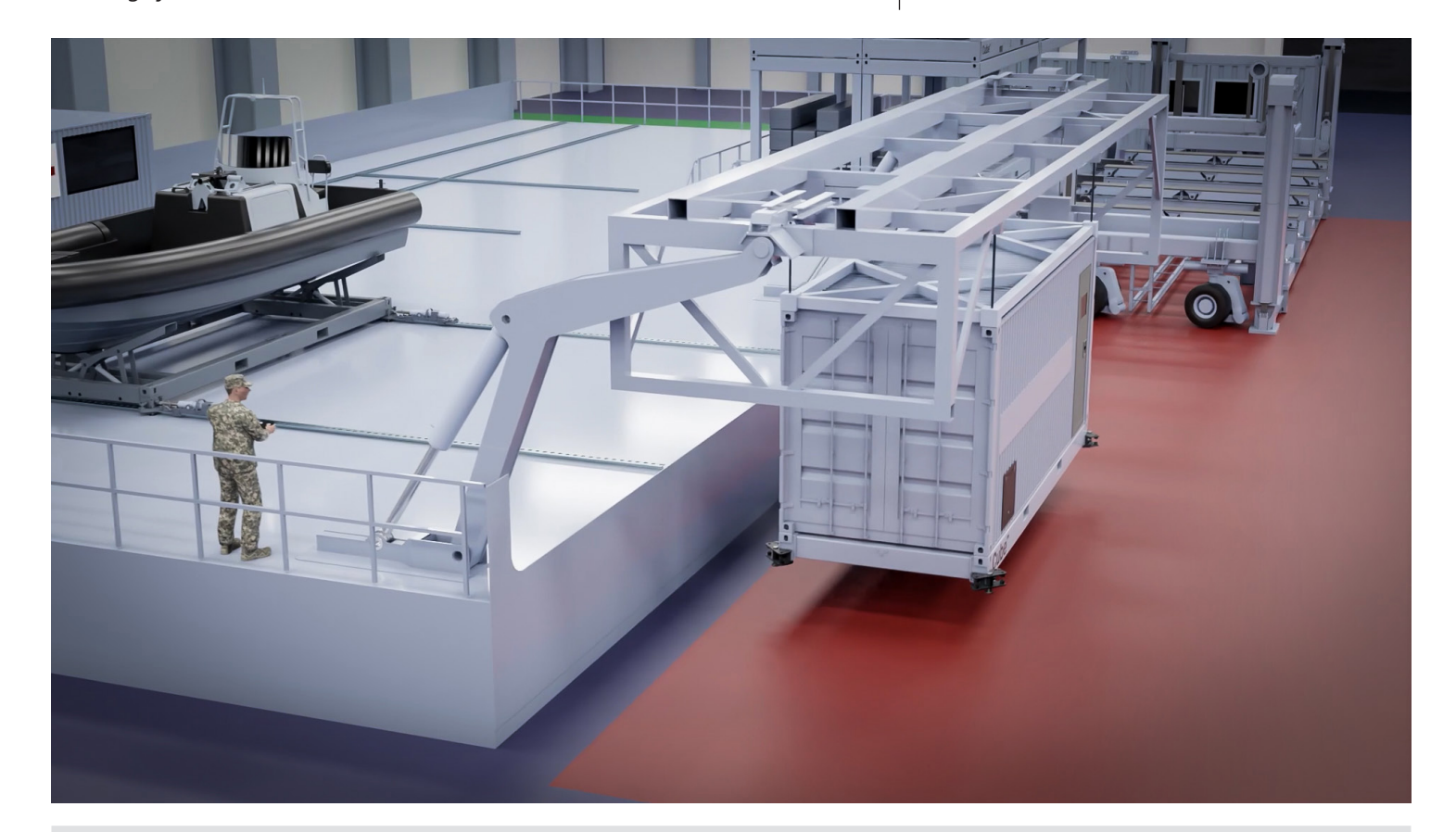
The illustrations show test facilities as they are intended in collaboration with Royal Navy.

The Side Launch Davit can pick up ISO 10', 20' and 40' containers or Cube<sup>TM</sup> modules, such as boats, from the quayside and insert them onto the Cube<sup>TM</sup> skidding system.