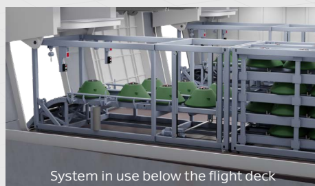
System in use below the flight deck